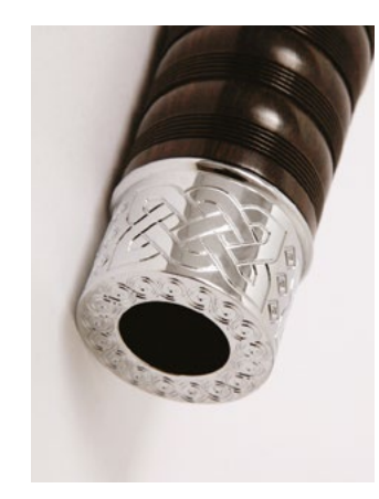
Nickel Design - Celtic