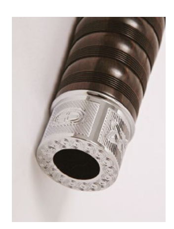
Nickel Design - Runic