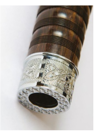
Nickel Design - Dot Knot