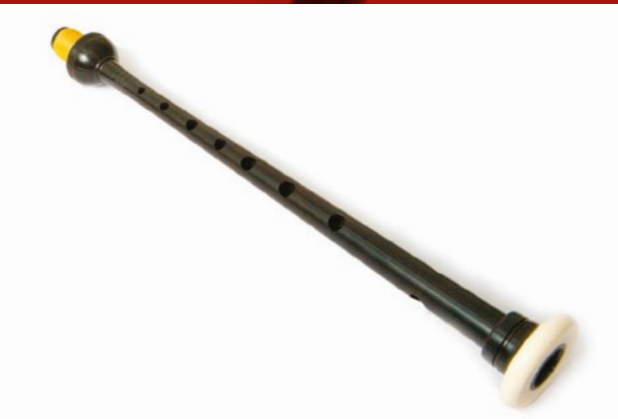
African Blackwood Pipe Chanter