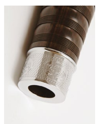
Nickel Design - Thistle