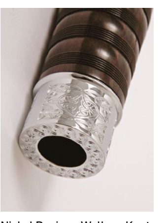
Nickel Design - Wallace Knot