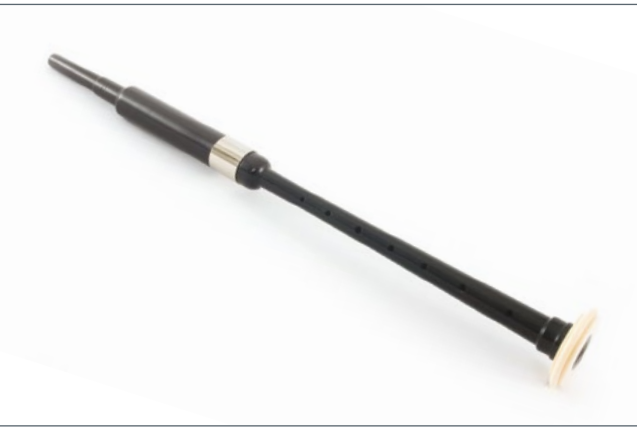
Practice Chanter With Imitation Ivory Sole & Nickel Ferrule