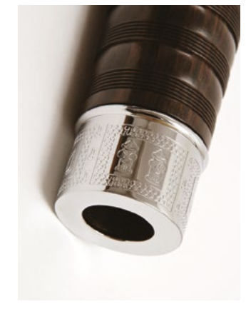
Nickel Design - Fire Dept.