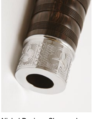
Nickel Design - Shamrock