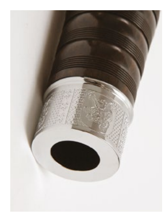
Nickel Design - Lion Rampant